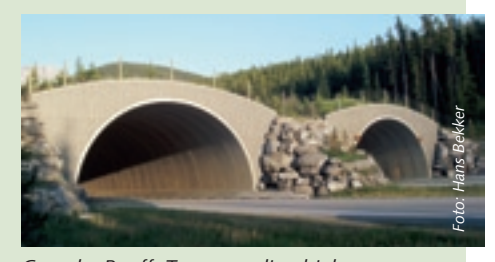
Canada: Banff. Transcanadian highway

A biologist from the Department of Transportation (Washington): 'We are inspired by Europe. That motivates us. A lot of attention is paid to fish migration here. We do very little where it concerns road defragmentation. Fragmentation is a big issue, but there is less compassion for ecology, although this is beginning to emerge. We now need to set standards, just like we have for safety standards, because you should not see defragmentation as being something special.'