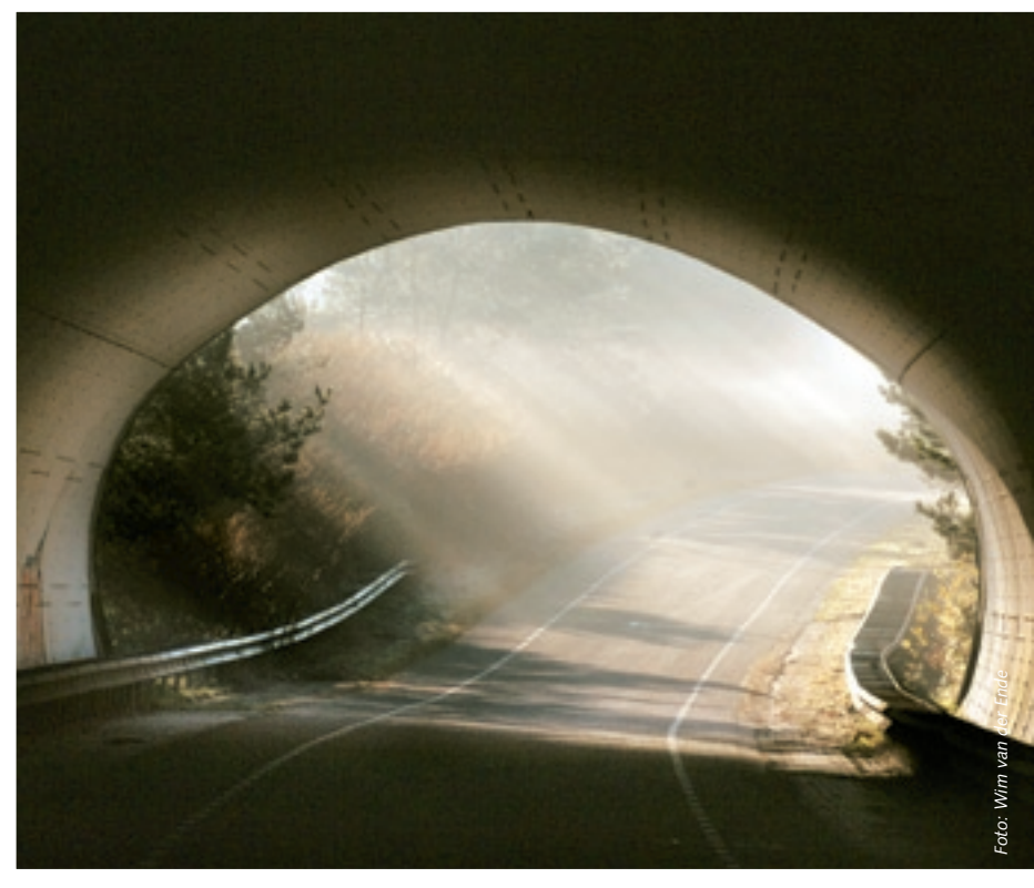
Tunnel over the parallel road under ecoduct Woeste Hoeve

'The Dutch government has been doing a good job as regards the fauna in the Netherlands', commented Machiel Bosch, manager of the Southwest Veluwe for the VN. When the A50 was constructed, it ran right through the valley of the Heelsumse beek. It was a unique and perfect valley. That would never happen nowadays. For example: the A50 is now to be expanded into a six-lane highway. But to mitigate for this, an ecoduct will be built near Wolfheze between the Wolfhezer and the Doorwerthseheide, an area which, in the past, formed a habitat for all Dutch reptile species. As a result of the