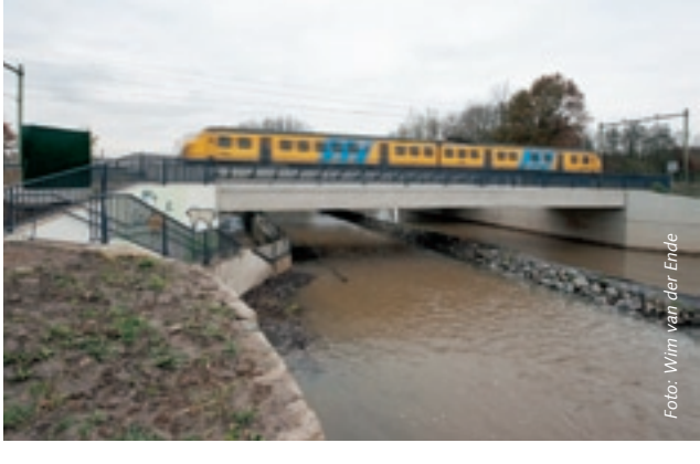
Vloedgraaf, and on the left a footpath/cycle path under the railway bridge

The bridge over the Vloedgraaf was delivered in early 2010, but its success is already evident. The rare water shrew, viviparous lizards and roe deer are only some of the animals benefiting from the new underpass. 'Water authorities do not have the explicit task of caring for terrestrial fauna and, furthermore, in the case of the existing