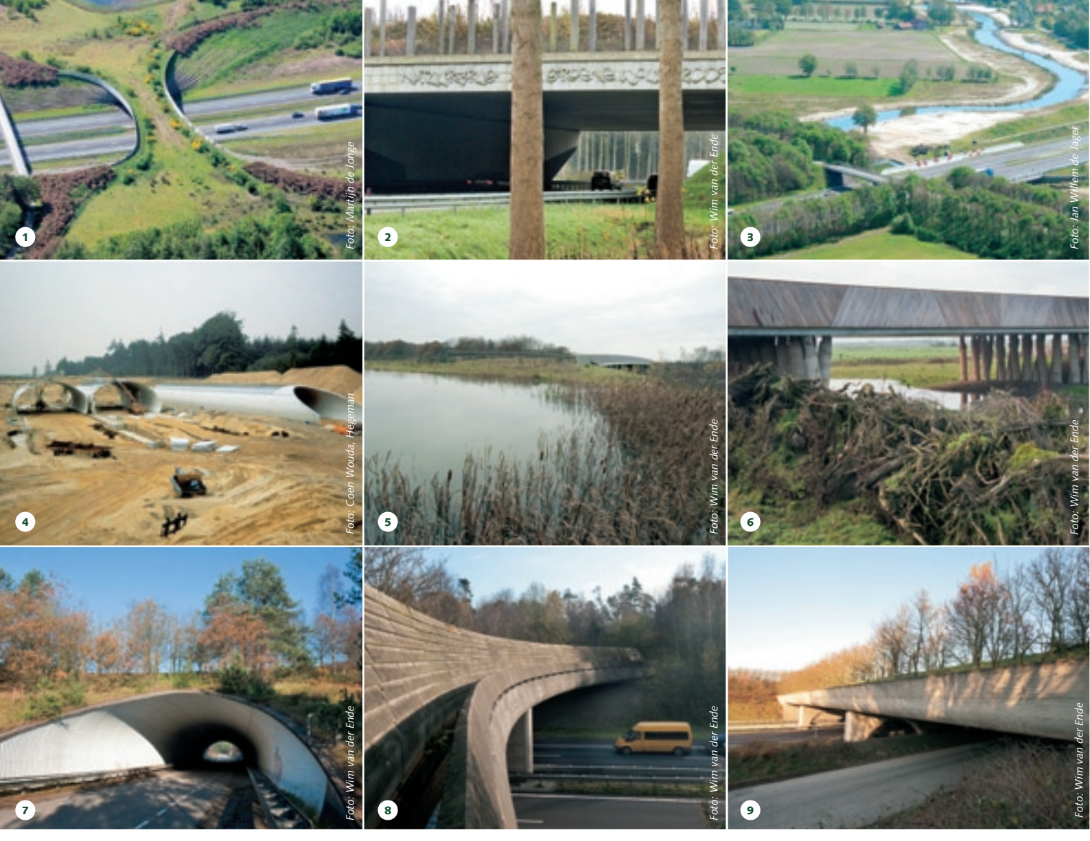
An ecoduct must blend nicely into the landscape (from left to right and from top to bottom)