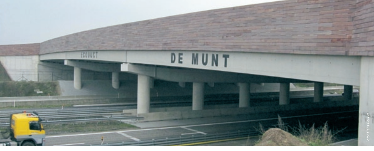
De Munt ecoduct over the E19 (Antwerp-Breda) and the HSL (high-speed railway line) near Loenhout will be completed in autumn 2011. A nature bridge will be built over the same road and over the HSL railway line near the Peerdsbos nature reserve. Wide rows of vegetation on both sides of the bridge will hopefully offer sufficient protection to encourage small wildlife to venture to the other side. Belgium also has an eco-veloduct – a bridge for cyclists and animals – which once served as a road bridge prior to its conversion